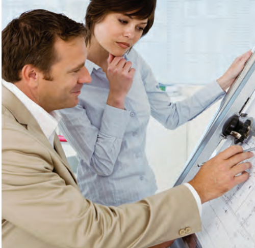
Skilled design service

“Our programs are based on a solid foundation of leadership and vision to provide better service, higher quality and more innovation than our competitors.”