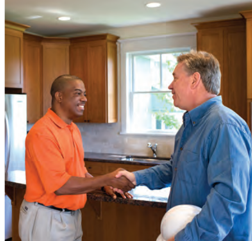
Experienced sales support