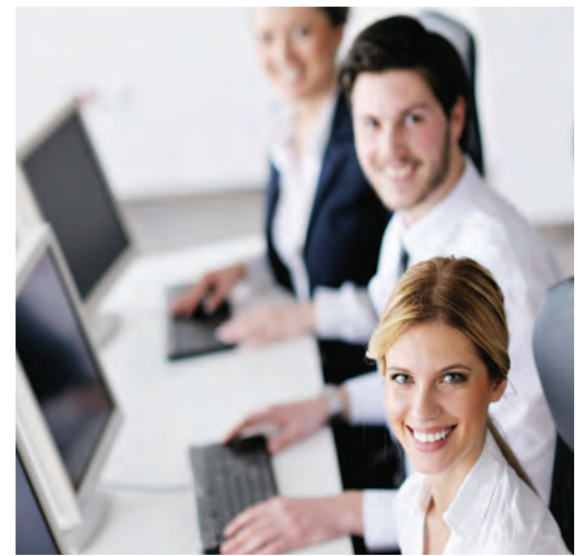
Attentive customer care